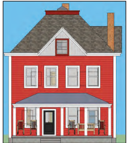
House drawings provided by VAF Architecture

We are making steady progress in our commercial district. We have our timeline planned for the new restaurant so stay tuned to the next edition of the OHI Journal for some exciting updates.