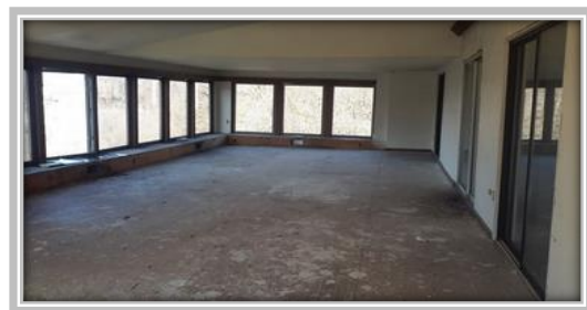
Apartments above Mr. Bill's

Progress continues on these three Perrysville Avenue properties. In February, a clean out crew emptied out all remaining contents and then selective interior demo was performed to open up walls and ceilings to eliminate surprises. Our mechanical systems engineer then worked with our architect to update drawings to add the changes made to the HVAC, electric and plumbing. An updated bid was then crafted to include all our funding sources and there are three contractors interested and the next step: construction!