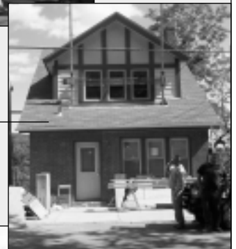
3000 Perrysville Ave.