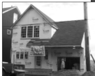
3012 Perrysville Ave.