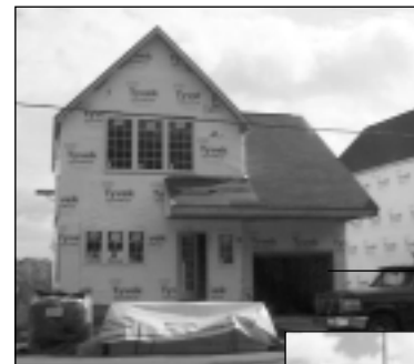
3008 Perrysville Ave.

A private developer is working with OHI to make that key corner in our neighborhood beautiful once again.