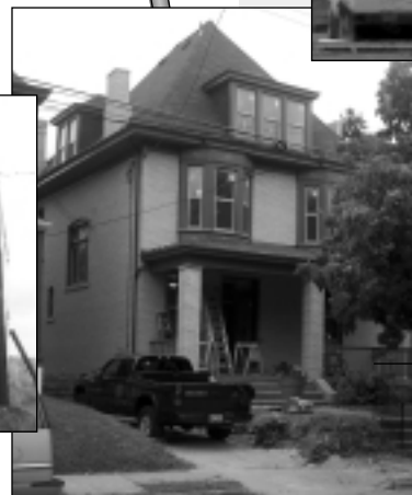
133 Marshall Ave.