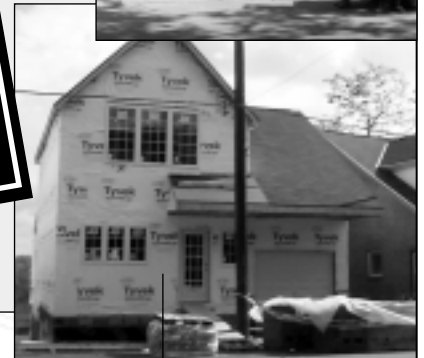
3004 Perrysville Ave.