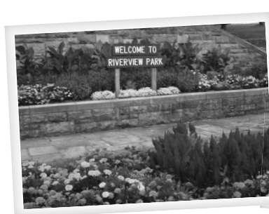
Riverview Park Entrance with garden maintained by volunteers.

Venture Street – Jan Moreland at mrsjan1103@verizon.net