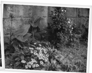
Venture Street landscaping funded in collaboration with Council President Harris' office, maintained by community volunteers.